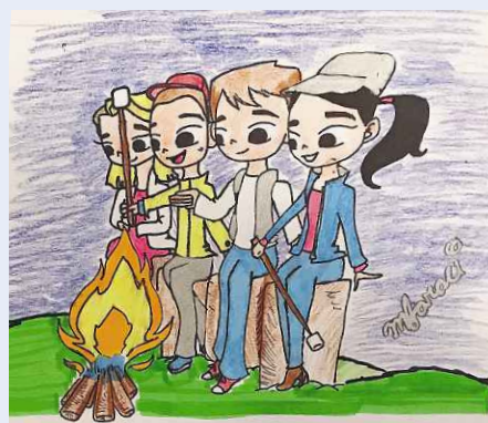
KIDSDAY STAFF ARTIST / MATT PARACI, SAYVILLE